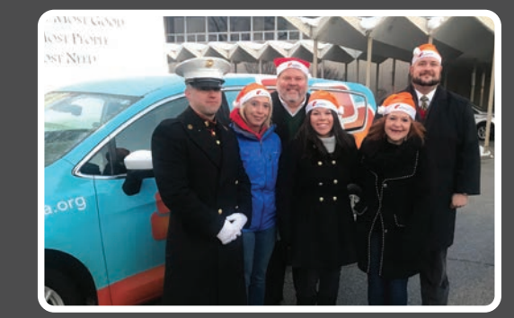
KWQC's Annual Toys for Tots drop off