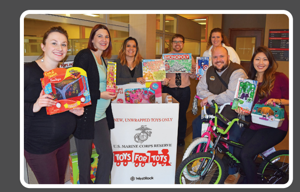
Toys for Tots drop off and fundraiser