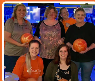
Ascentra shows support for Junior Achievement at the Bowl-A-Thon in Clinton!