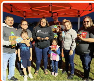
Our Muscatine staff had a blast at Almost Friday Fest!